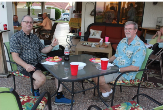
The "unidentified" guests!!