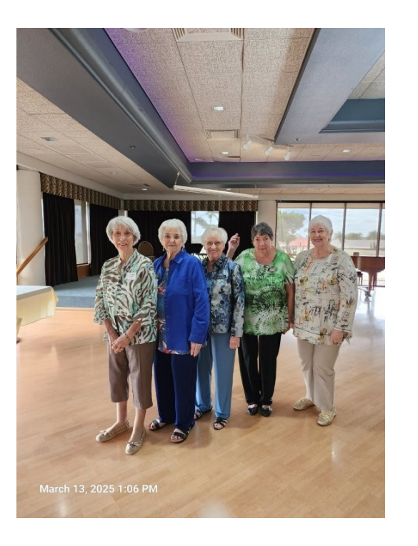
March, 2025 Birthday Gals!